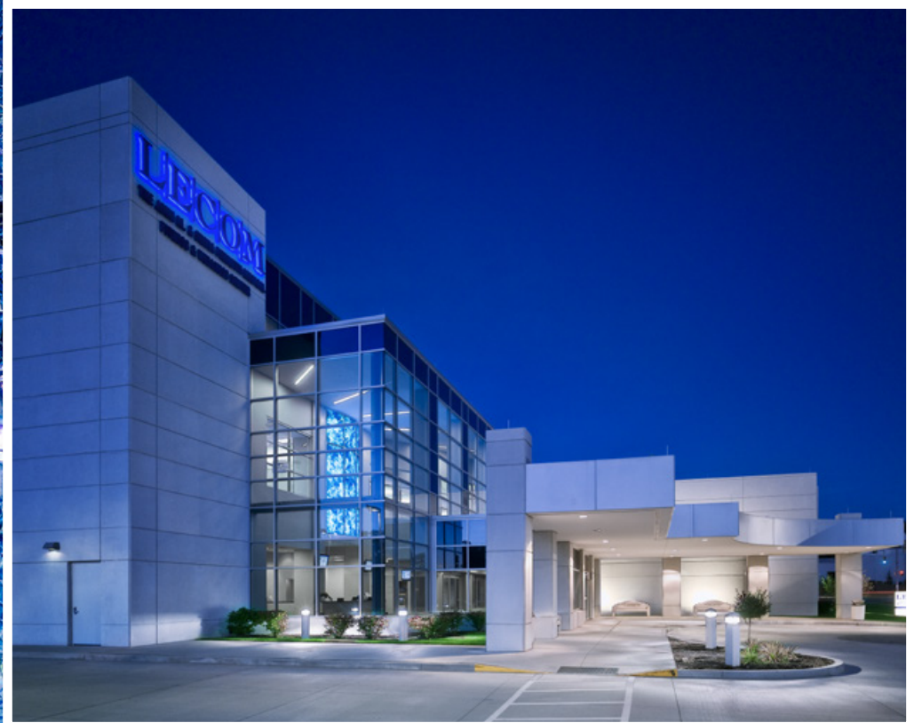
Lake Erie College of Osteopathic Medicine Wellness Center - Exterior View Erie, PA