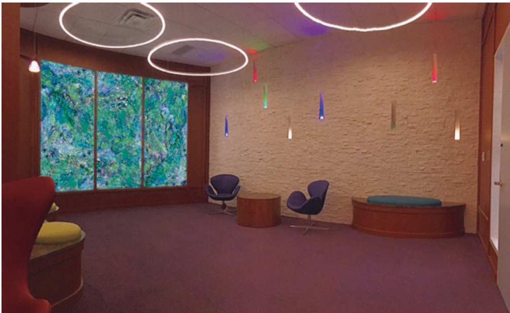
Cook Children's Medical Center Meditation Chapel Fort Worth, TX