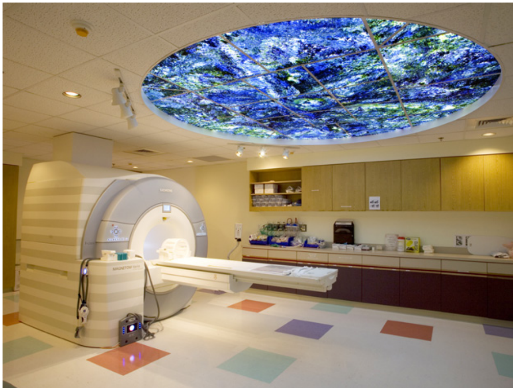
The Children's Hospital of Philadelphia MRI Suite Philadelphia, PA

Mind-Body Health Sciences, Inc. Boulder, CO